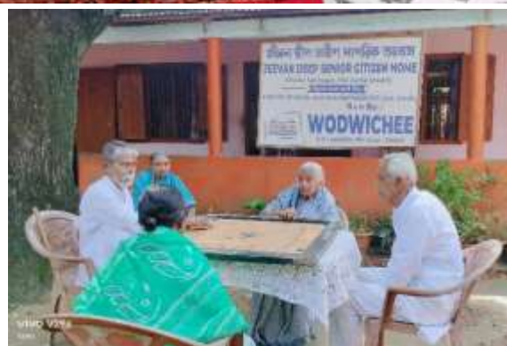
Beneficiary Summary of Senior Citizens' Home District 2024-25