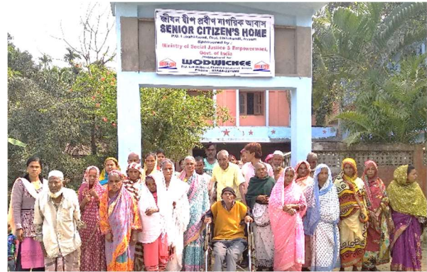
[Hon,ble Minister of Women & Child Dev. Govt. of India & DC, Hailakandi interacting with the beneficiaries]

The Senior Citizens' Home at Lakshirbond district Hailakandi is rendering services since 1999. The Home is housed in its permanent building. Senior citizens whose lives are affected by lack of care and protection are admitted into the Home. The beneficiaries are provided with shelter, food and nutrition, medical care, mental respite through recreation and need based counselling. Some of the beneficiaries are also restored to their families after checking out the care and protection elements available in the family. To encourage active and productive ageing, vocational trainings are provided to the beneficiaries. Elderly-friendly production activities are carried out in the Home through which the senior citizens are helped to make small earnings. This component has been found meaningful in giving the senior citizens a sense of being productive and the required confidence to lead a dignified life. During 2022-23, the 41 nos. of senior citizens have been provided with residential care & services. The details of beneficiaries covered during 2022-23 are given in the table above.