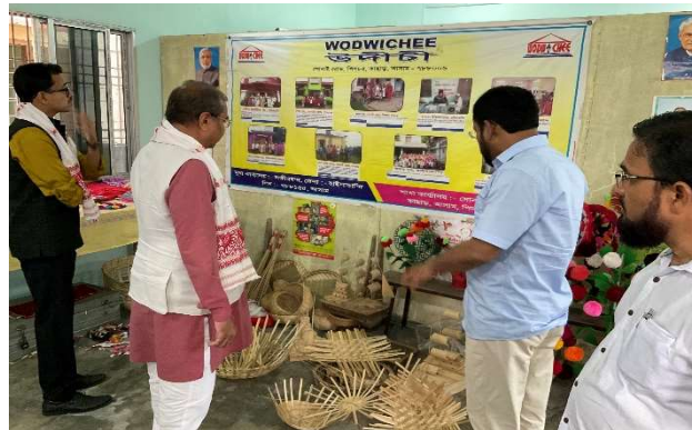
[Hon,ble Minister of Women & Child Dev. Govt. of India visiting the Shakti Sadan Ch-II]

The erstwhile UJJAWALA Scheme was converted to Shakti Sadan Chapter – II with effect from 1 st August, 2022 in accordance to the Mission Shakti Guidelines issued by the Ministry of Women and Child Development, Govt. of India. With the support of Ministry of Women and Child Development, Govt. of India, WODWICHEE has been implementing the scheme for the prevention of Trafficking and Rescue, Rehabilitation and Re-integration of Victims of Trafficking for Commercial and Sexual Exploitation. A dedicated team of social workers carried out outreach activities in different vulnerable places for identifying and rescuing the victims. The Project also provided an opportunity to the victims for institutional employment/self-employment for sustaining themselves in the society. Various activities have been undertaken under the following components.