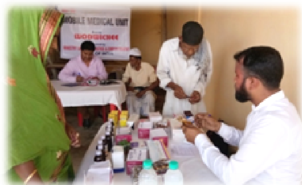
Service Summary of Mobile Medical Unit

The project is sponsored by the Ministry of Social Justice & Empowerment, Govt. of India. During 2021-22, a total of 4831 nos. of senior citizens have been rendered medical services by the MMU Team. The team reaches to the designated locations in a specially designed van equipped with medicines, lab equipment, emergency kits etc. The details of beneficiaries covered during 2021-22 is given in the table.