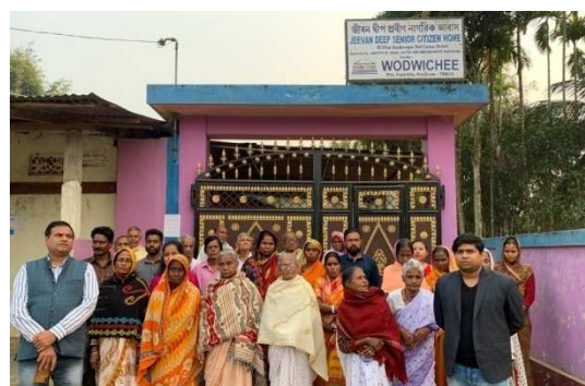
Beneficiary Summary of SrCH, Cachar

Some of the beneficiaries are also restored to their families after checking out the care and protection elements available in the family. In such cases, a thorough counselling process is adopted with the family members who are responsible for the care and custody of the senior citizens being restored. The details of beneficiaries covered during 2021-22 is given in the table.