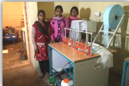
Beneficiaries Summary for 2021-22

Owing to orthodox stigma and socio-economic backwardness and limited accessibility to reproductive services in the rural areas of Barak Valley, the poor women and girls face a lot of challenges in meeting their reproductive health needs. The rural women and girls cannot afford to use quality sanitary napkins available in the market. In view of this situation, WODWICHEE started a Training cum Production Centre for low cost sanitary napkins. This effort has been found to be effective in both improving the health status of the poor girls and women and opening up an income generating window for the successful trainees of the centre. During the year under report a batch of 09 nos. of women have been provided training and out of them 4 have already started their own units producing and selling the low cost sanitary napkins.