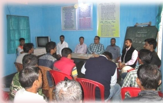
Group Counselling Session

The high magnitude of drug addiction in two bordering states viz., Manipur and Mizoram has badly affected youths in the region of South Assam (Hailakandi, Karimganj and Cachar Districts) in recent years. Paddlers and drug traffickers have been finding it easy to make their way into to this region increasingly with the growing communication and transport system in the region. As a result, addiction among students, youths and many working class people have been rapidly increasing which demanded urgent intervention specific to the region.