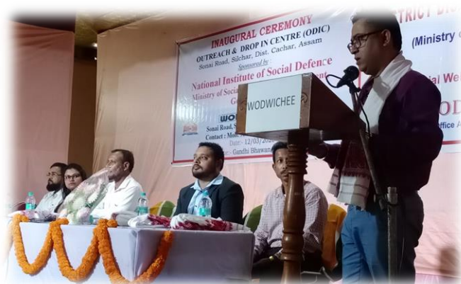
Inaugural function of the ODIC

The Govt. of India has selected Cachar, Hailakandi and Karimganj districts for targeted intervention under National Action Plan for Drug Demand Reduction (NAPDDR). In the backdrop of prevailing scenario WODWICHEE started the Project Outreach and Drop in Centre (ODIC) at Sonai Road, Silchar, District Cachar on 1st Jan, 2020 in accordance to the sanction of grant in aid