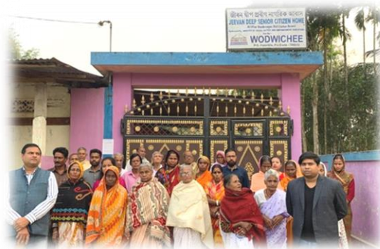
Beneficiary Summary of Senior Citizen's Home, Cachar

At the time of reporting, 25 nos. of older persons have been residing at home. The project is sponsored by the Ministry of Social Justice & Empowerment, Govt. of India.